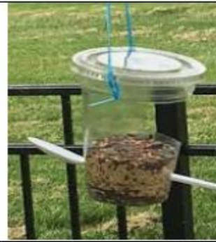
Plastic cup and lid