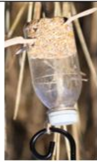
Small plastic bottle