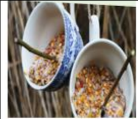
Old mug or teacups