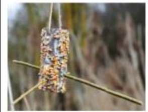
Kitchen or toilet roll